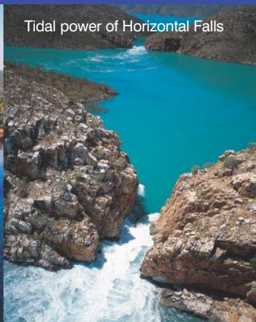
Tidal power of Horizontal Falls