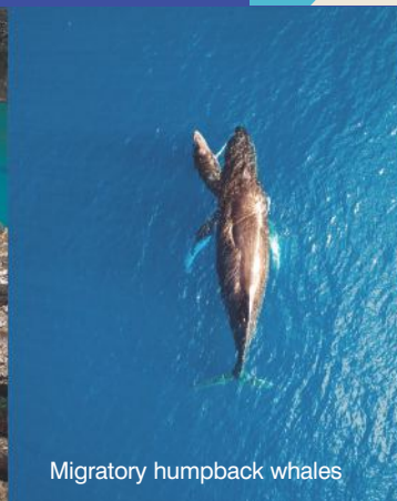
Migratory humpback whales