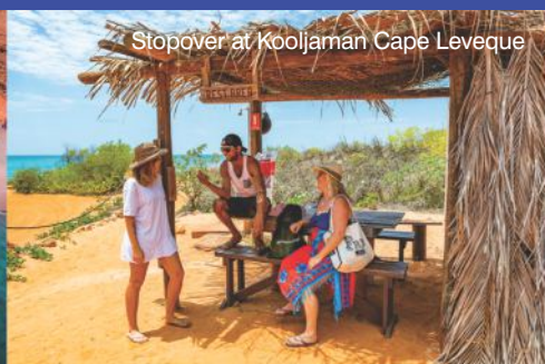
Stopover at Kooljaman Cape Leveque